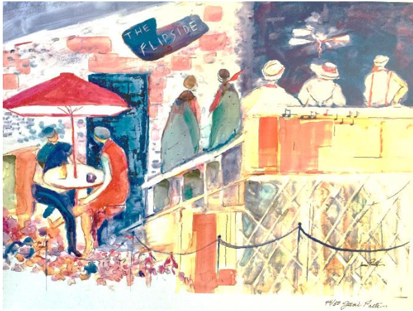
2011 Winner, Jane Prete Flip Side